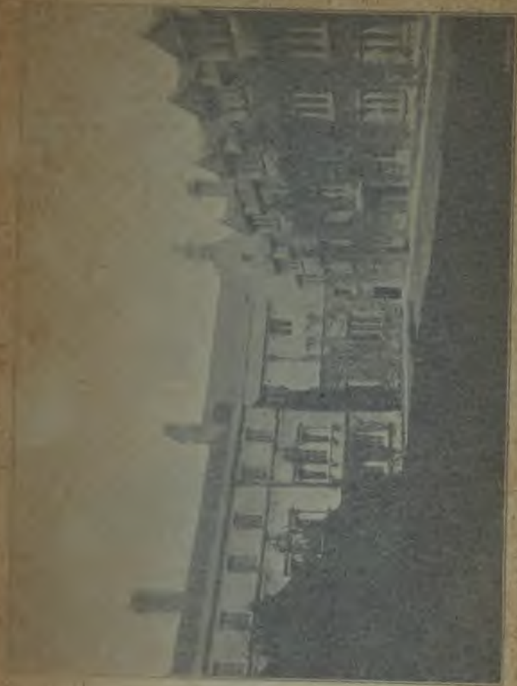
View of Photograph by (A)